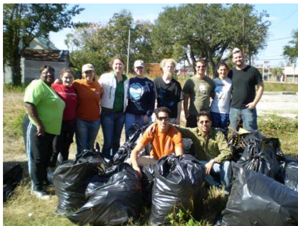
Left: Volunteers from the Jewish Funds For Justice Service Corps in Atlanta